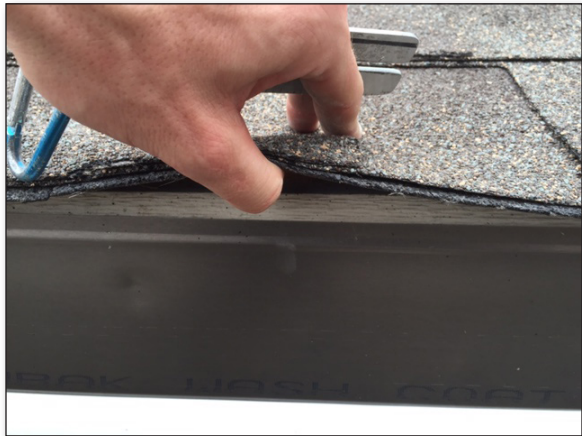
Number of layers: felt, starter shingle and drip edge flashing code items