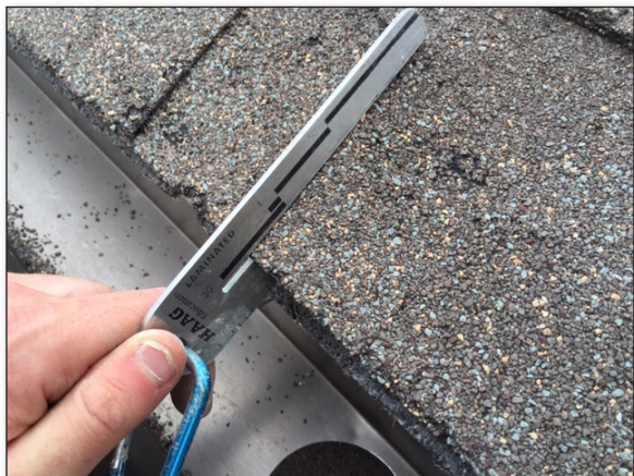
Haag Shingle gauge: Identifies year, model and type