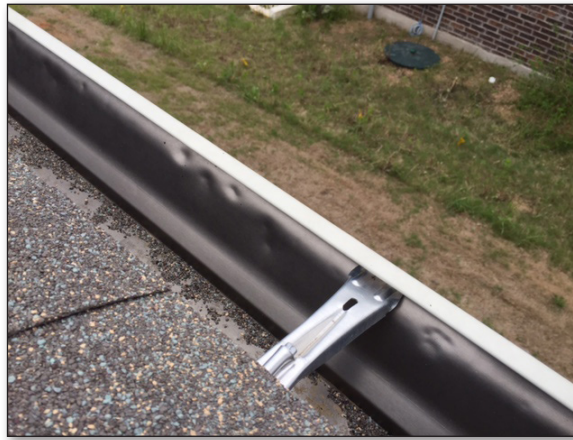
Collateral damage to gutters, windows, A/C unit and sliding recorded