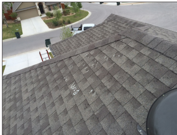
All directional slopes inspected as per insurance guidelines for storm damage