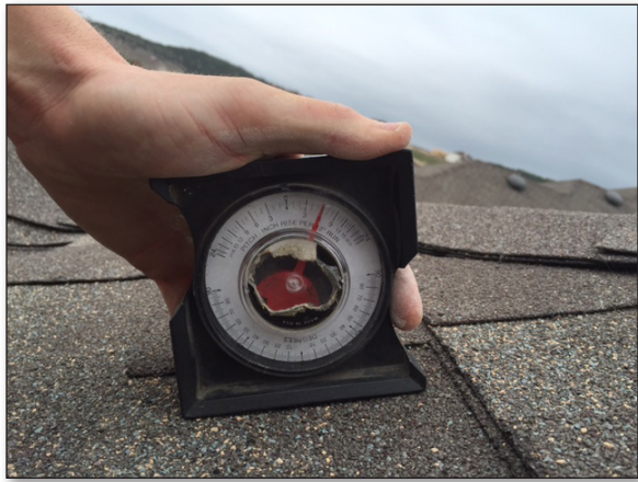
Roof pitch gauge measurement